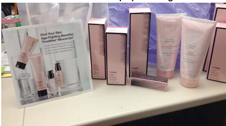
Exhibit 3: Products Display at Rodriguez's Desk