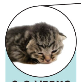
O-2 WEEKS Eyes still closed or just beginning to