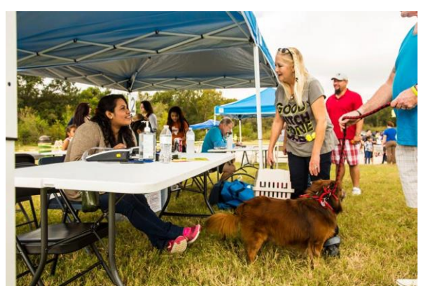
Rabies Vaccination Clinics are just one of the events the Outreach team facilitates to serve and educate our community.

The goals of these programs are to reduce shelter intake, provide humane education and prevention based intervention, and build partnerships through community events, classes and presentations. All volunteers are invited to help talk about the services and mission of the center at these outreach and education events.