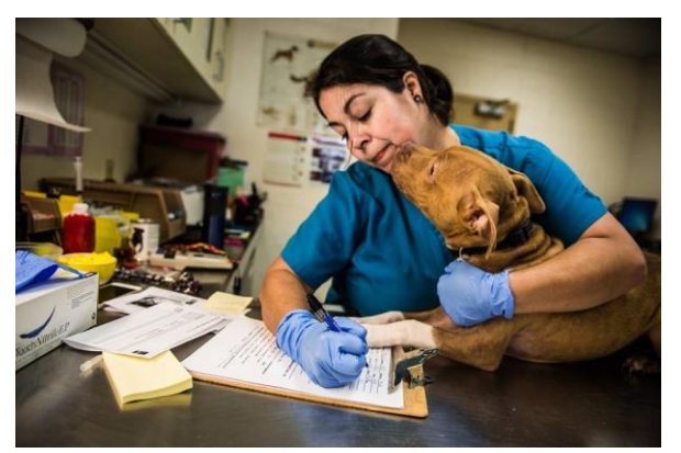
well as regular treatment and medical care for all the animals that arrive.

There are many volunteer roles that support the Vet Services team. Volunteers are needed in anesthetic recovery, following spay or neuter surgery, treating upper respiratory infection (URI) kitties, dipping ringworm positive kitties, or providing physical therapy to animals healing from injury.