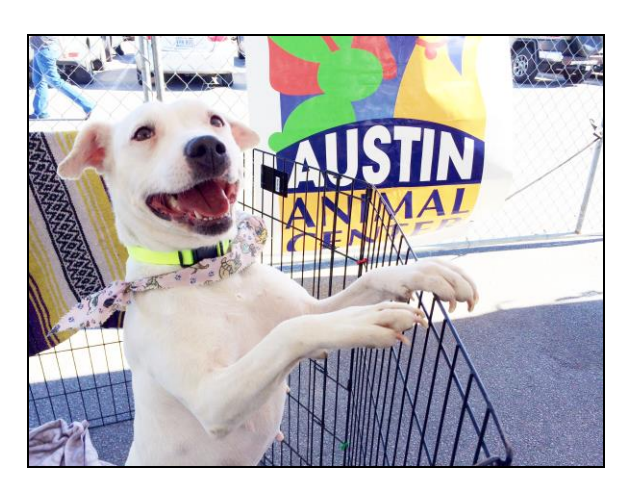
The Austin Animal Center helps connect pets to people through offsite adoption and engagement events. Come join our Outreach and Engagement Team today!

Each assignment in Volgistics includes a job description exploring the appropriate trainings to take. Many specialized volunteer roles, such as working in veterinary services, photographing the animals, or assisting behavior staff inside the playgroup play yard, will require interviews and further hands-on training with staff or volunteer leads in those areas.