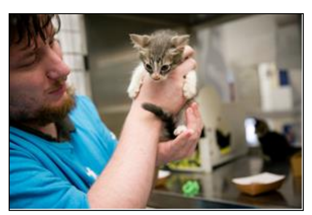
Each year around April and October, we experience an increase in kitten intake. We opened the Kitten Nursery in 2017 to provide these little guys the specialized care they need.

Once you have identified the team you will be working with, you will be assigned to a staff or volunteer mentor. This individual will serve as your trainer, guide, and support as you begin your service at the Austin Animal Center. You will be required to attend at least one shadow session with this mentor before your first official volunteer shift. If you are interested in more advanced job roles, you may be required to attend additional sessions, trainings, or an interview process. The Pathways section will address this in more detail.