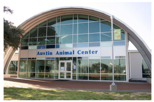
Austin Animal Center located at 7201 Levander Loop, Austin, Texas.

ustin Animal Center (AAC), the nation's largest open-intake municipal shelter, provides shelter and welfare services to around 17,000 animals each year and animal protection services to all of Austin and unincorporated areas of Travis County. AAC is an open-intake facility where lost and surrendered animals from Austin and the unincorporated areas of Travis County in need of shelter are accepted regardless of age, health, species or breed.