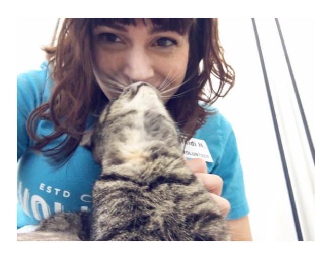
Providing daily enrichment and socialization to the shelter pets is one way to decrease stress & help them adapt while they await adoption.

rescue partners. These organizations network with the shelter on a regular basis and work diligently to help our pets find the perfect new homes they deserve. Approximately 30% of animals in the shelter are transferred to rescue partners. The participation of our partners is vital to AAC's live outcome goals.