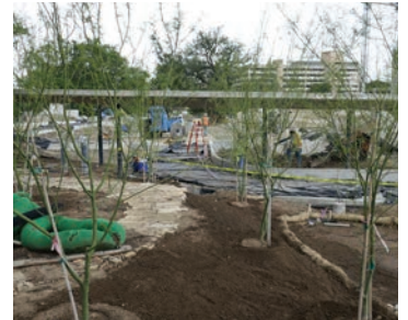
New plantings installed in southwest corner of the park, Suzanne Deal Booth Promenade in the background

Status: In Construction. Waterloo Park Construction continues with significant COVID-19 prevention and safety measures taken on site, following all Austin Public Health and CDC directives. With nearly 200 workers on site daily, significant progress is being made rapidly. At the Moody Amphitheater, the canopy structure is complete while interior finishes are finalized, and green roof pavers are being installed. In the park, the Heritage Deck steel structure is in, and wood decking is in progress. The Deal Booth Promenade (S-Bridge) deck is fully constructed, and all large trees have been installed. Soils, irrigation, and planting is transforming the construction site into the future park – sod for the Great Lawn recently began installation. The stone slide and other play area stonework is underway, and the Family Pavilion building is almost complete. The Waller Creek restoration portion of the project (Sector 9) continues with the critical path work including stacked limestone toe walls on both sides of the creek that will form the footings for the proposed caliche rock walls above. Substantial completion is scheduled in late December 2020.