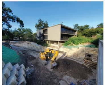
Restoration work within Waller Creek