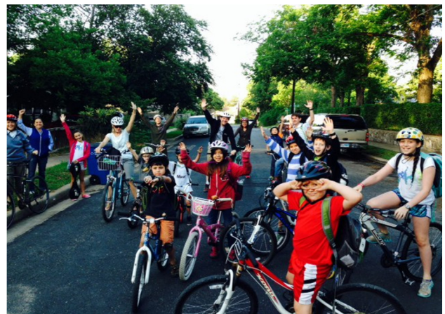
STUDENTS AT BRYKER WOODS ELEMENTARY PARTICIPATING IN THE BOLTAGE PROGRAM (PHOTO COURTESY OF CORD DOVER).

There is much opportunity to further promote bicycling to all school age children. Students, families and school staff all need more resources to increase bicycling use at schools. High schools are particularly underserved at this time and need attention. These educational and promotional efforts will support the City's investment in an all ages and abilities network. The combined infrastructure and program efforts will result in significantly increased ridership to school and healthier and more engaged students who will become the next generation of Austin's workforce and citizen body.