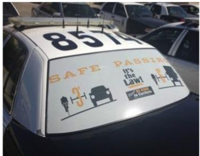
APD PATROL CAR WITH EDUCATIONAL MESSAGE USED IN THE SAFE PASSING LAW CAMPAIGN.

The highest priorities to provide safer conditions for people on bicycles is enforcing laws related to driver speed, distraction, and impairment. Speed is often thought of as a law to be mildly disregarded, but if Austin is going to become a safe place to walk and bicycle then the enforcement of excessive speed of motor vehicles will have to be taken seriously. Higher speeds are a leading contributor to dangerous outcomes and give less room for human error. Distraction and impairment are often what make speed dangerous and deadly. Austin already has ordinances banning texting while driving, which should be enforced with a no tolerance policy. Lastly, drug and alcohol impairment needs to be taken more seriously both through enforcement and the consequences of being caught driving. Enforcement and publicity of stings of the safe passing law and impaired driving are great opportunities to educate drivers to the needs of cyclists and pedestrians.