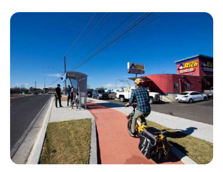
Floating Bus Stop on Stassney Lane at South 1st Street

Floating bus stops (or "side boarding islands") are designed to improve safety for bicyclists and pedestrians, and clarify interactions among all modes.