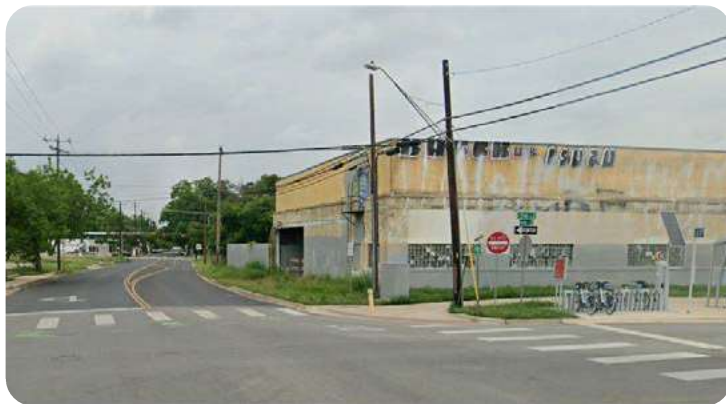
Shady Lane at East Fifth Street

A new sidewalk along the east side of Shady Lane will make both the transit hub and the MetroBike station more accessible.