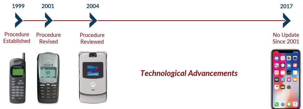
Exhibit 3: The Citywide Procedure Has Not Kept Pace with Technological Advances