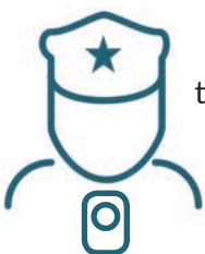
Exhibit 4: Cameras were placed correctly, continued to operate in inclement weather, and effectively recorded audio.

We reviewed 151 body-worn camera videos taken by officers between August 1, 2018 and January 31, 2019. 3 In 151 of 151 (100%) of videos, the camera was placed correctly on the officer's uniform and stayed attached throughout the whole video, and the camera continued to operate in instances of inclement weather. In 150 of 151 (99%) videos, the camera recorded audio for the entire video. These results are shown in Exhibit 4.