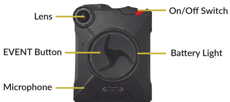
Exhibit 1: Features of APD's Body-Worn Cameras

SOURCE: OCA analysis of APD body-worn camera training materials, May 2019.