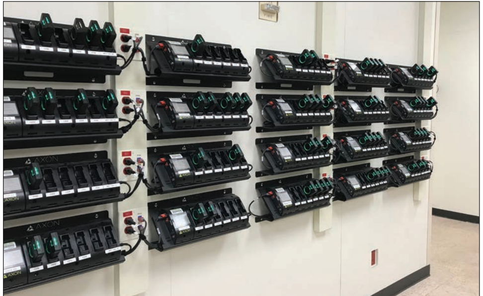
Exhibit 3: APD Body-Worn Camera Docking Stations